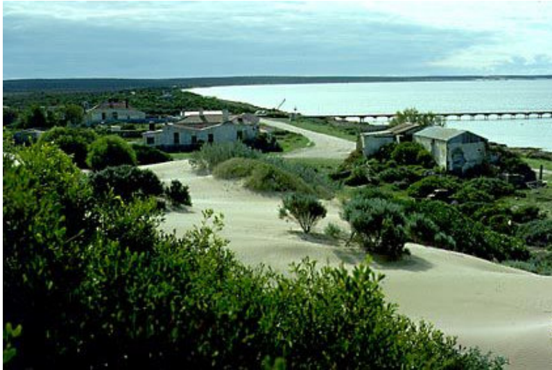
Fowlers Bay today

Fowler's Bay is in South Australia at the extreme west end, on the Southern ocean. It is at the far west of the Far West – the Wild West of Australia – and where the Great Victoria Desert begins. The Far West is a narrow strip of coast line between the sea and the desert stretching for about a 100 miles. Today it is almost as remote, inhabited by some 5000 souls known as The Coasters.