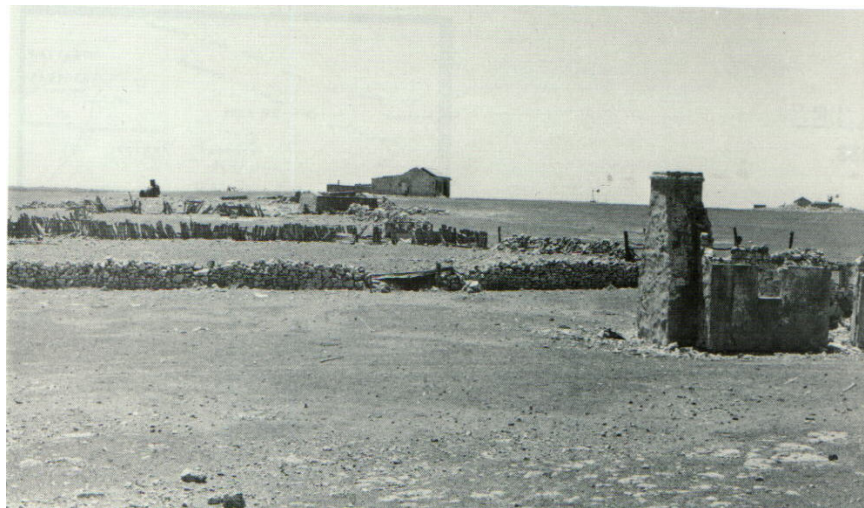
The stone fences of the sheepyards at Yalata station. Old woolshed at top (Faul)

By the late sixties, the enormous Barr Smith sheep run had been created. It had two names: either the Fowler's Bay run or the Yalata run, after the original head station.